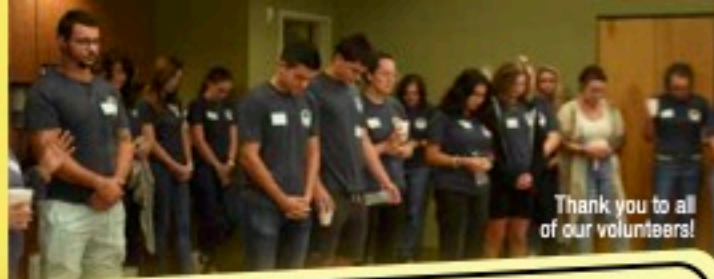
Thank you to all of our volunteers!