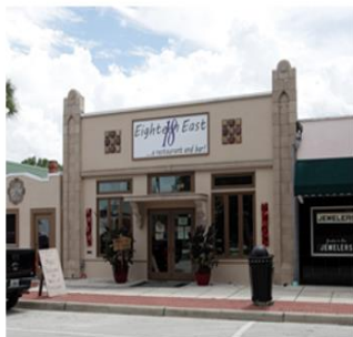
Eighteen East Steak House

*Meet in Lobby at 7:15 pm Welcome & Dessert: ReFOcus Devotion Topic: Our Identity