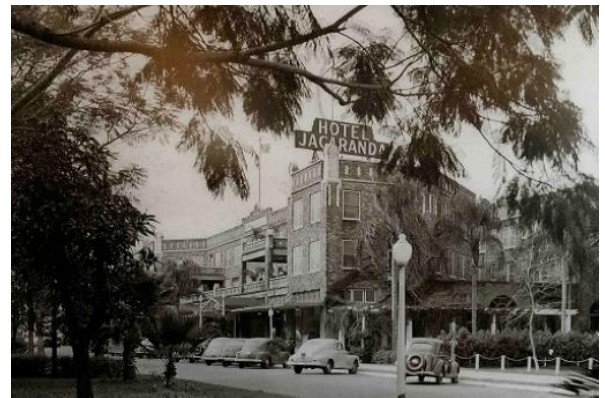
HOTEL JACARANDA LOBBY

For dinner we recommend: Eighteen East Steak House (across the street from hotel) 18 E Main St, Avon Park, FL (863) 453-1818 https://www.facebook.com/eighteeneast/