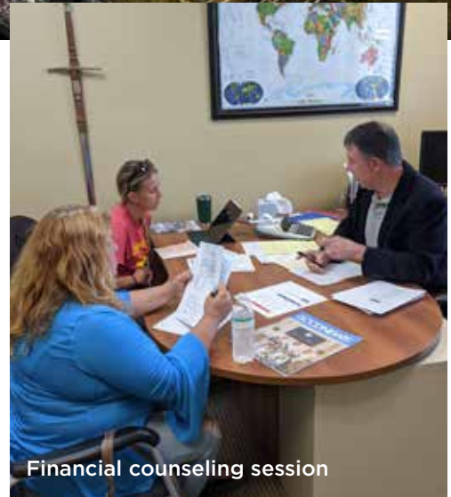
Financial counseling session

Over 250 single moms and families receive assistance each month.