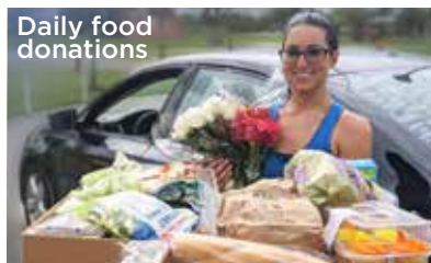
Daily food donations