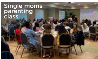
Single moms parenting class